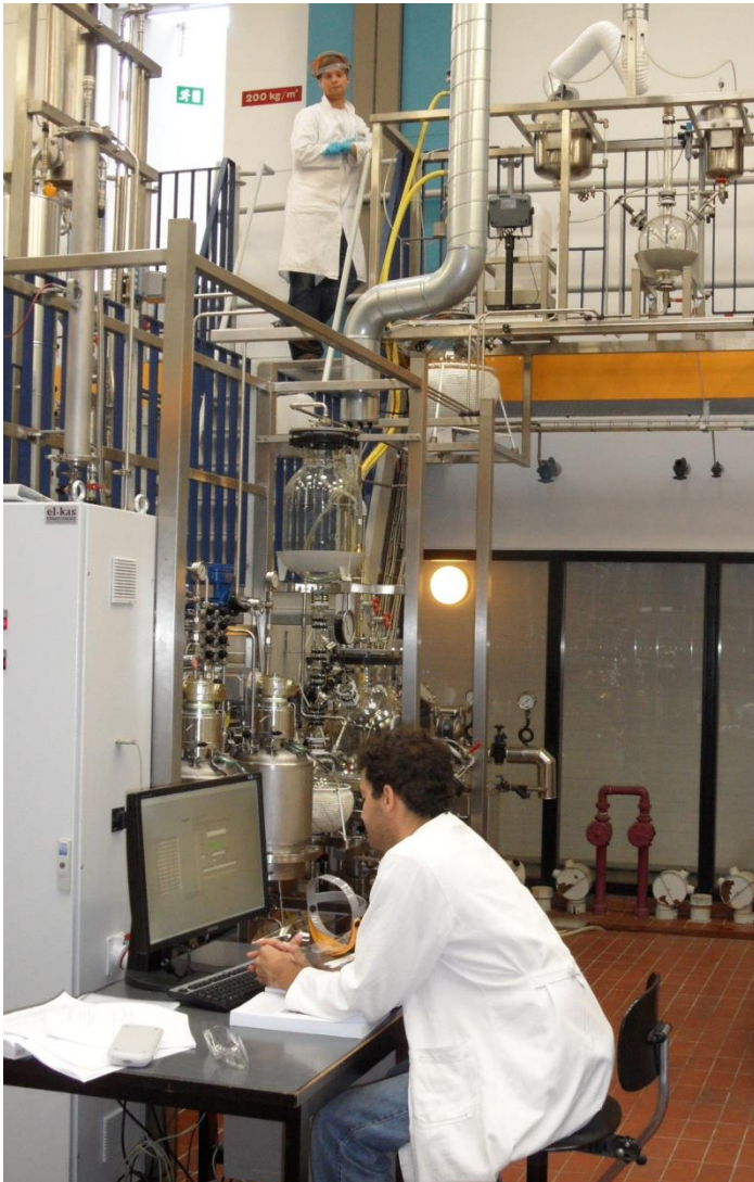
DTU Chemical Engineering Technical University of Denmark

The plant is a multipurpose design for various organic synthesis. Originally build for homogenously catalyzed biodiesel production it can also operate with immobilized enzymes in backmix and fixed bed reactors.